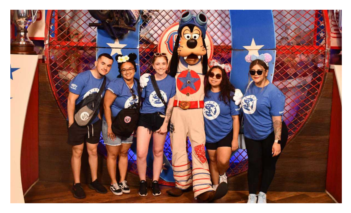
The TAPS Young Adults Program received a one-of-a-kind Disney SALUTE welcome to the Magic Kingdom at Walt Disney World. Thanks to the NFL, attendees spent a weekend making core memories and peer connections.