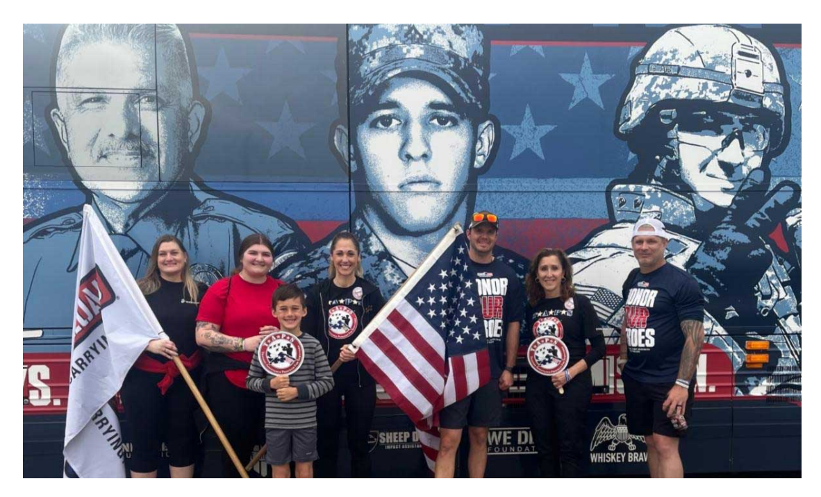
TAPS survivors and supporters participated in 27 Carry the Load walks nationwide throughout "Memorial May" in this coast-to-coast mission to honor all those who have sacrificed for our country.