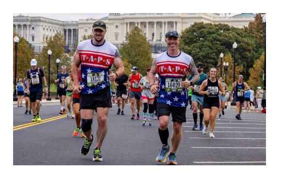
Team TAPS Events

Honoring Loved Ones at Events Nationwide